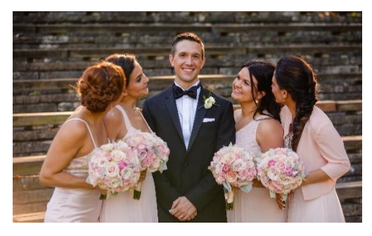
Bridal Bouquet - $300.00 - $400.00 +

Bridesmaid Bouquet - $100.00 - $150.00 +