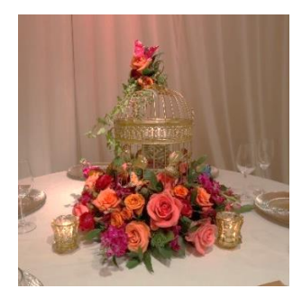
10 Guest Tables Decorated with High Floral Centerpiece @ $450.00 - $650.00+ Per table